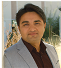
DR. HEALTHY DESAI ORTHOPEDICS