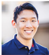
DR. MICHAEL CHONG DENTAL